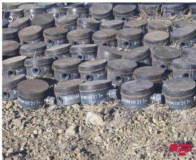
Photos 3–4: Landmines produced in Armenia in 2021, found in Saribaba height