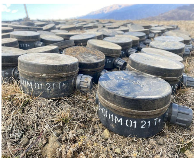
Photos 5–6: Clearance of minefields from Armenia-produced landmines